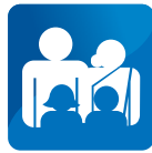
FAMILY FLOATER HEALTH GUARD